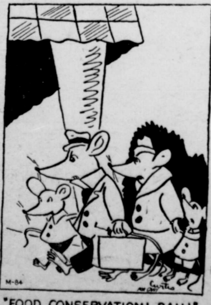
"FOOD CONSERVATION! BAH!"