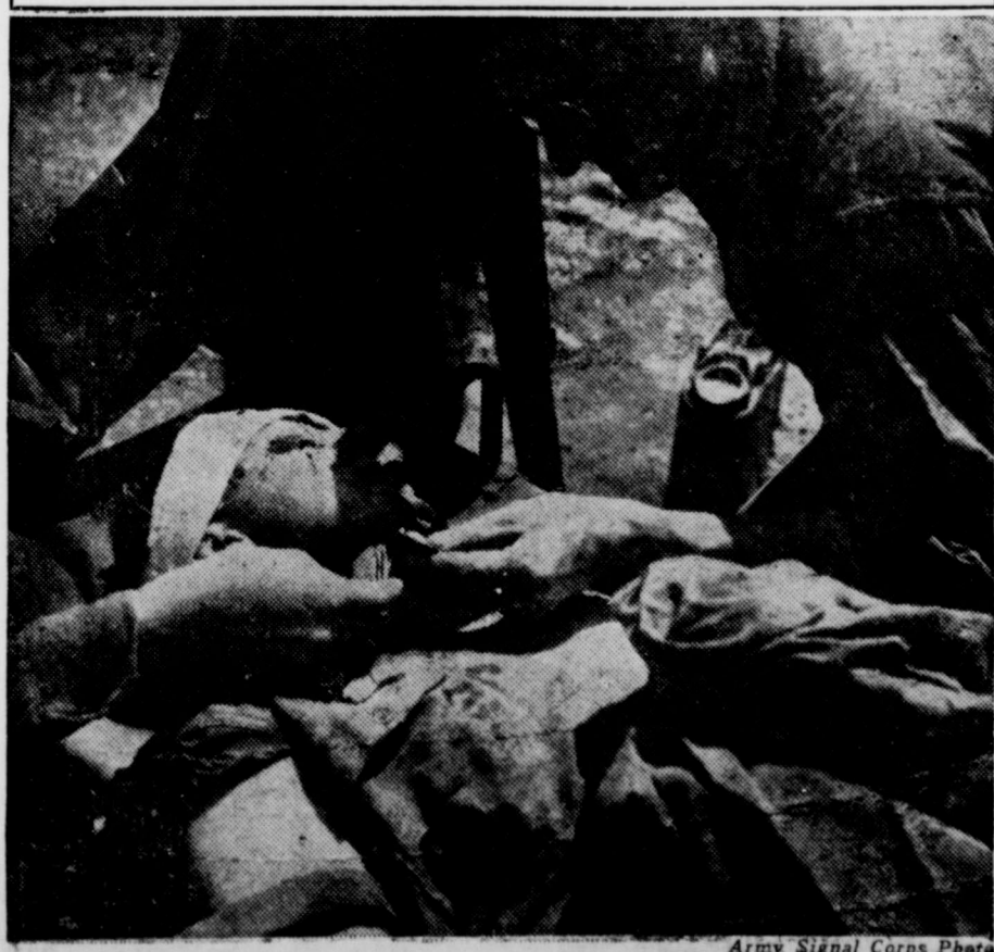
An army doctor with the Fifth Army in Italy looks at the dog tags of a dead American soldier so that his beloved back home may know that he gave his life for his country. All your country is asking you to do is to give your dollars to back up the men who are fighting for you by buying War Bonds.