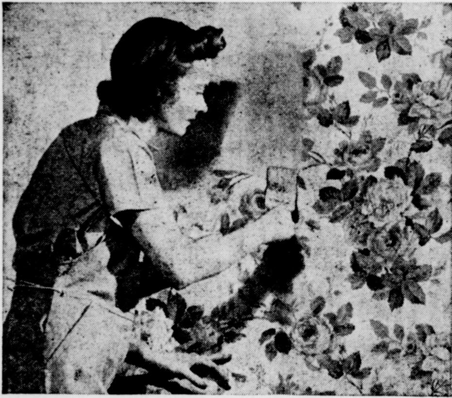
Amateur with brush or applicator can do professional job.

THE new war-born plastic wall finishes make redecorating these days a far cry from old-style painting, when rooms were unusable for days while 2 or 3 coats of slow-drying paint were applied. Dora May Talcott writes in the Rural Home section of Capper's Farmer, a magazine read by 1,250,000 farm families.