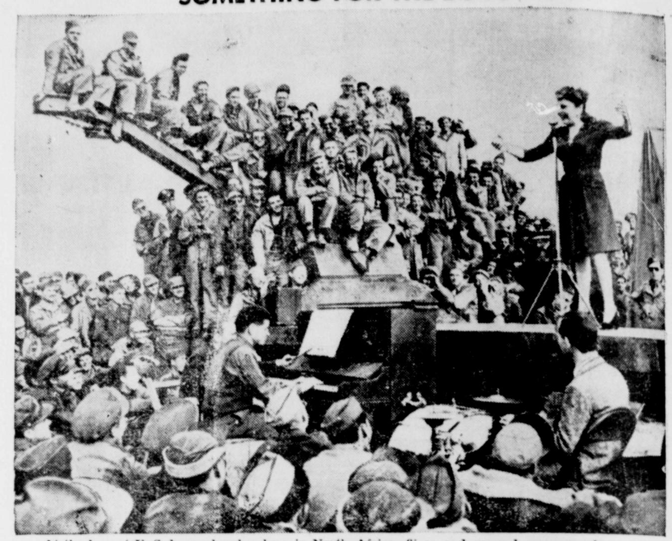
At the largest U. S. heavy bomber base in North Africa, fliers and ground crew members of the Army Air Forces are entertained by Martha Raye, screen and radio singer, one of the leading figures in the show world sent wherever American Boys are stationed, by USO-Camp Shows, a member agency of the National War Fund.