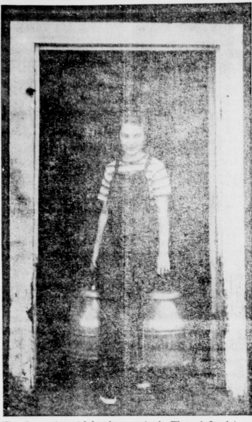
This Connecticut girl does her part in the Women's Land Army by taking care of the milk on a dairy farm. She gets up at 4:30 in the morning and starts work at 5. She cools the milk, bottles 640 quarts, sterilizes the cans, and washes the milking-machine equipment. Thousands of women and girls over 18 years of age are wanted for the Women's Land Army of the U. S. Crop Corps Volunteers. Anyone interested in joining may get information from the county agricultural agent or a local office of the U. S. Employment Service.