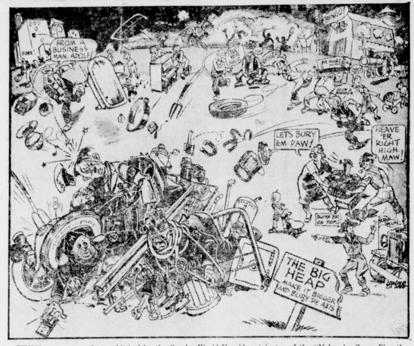
THIS cartoon was first published by the Omaha World-Herald, originator of the "Nebraska Scrap Plan." In three weeks the people of Nebraska collected 136,171,012 pounds of scrap metals for war industries. ounds per capita for every man, woman and child in the state.