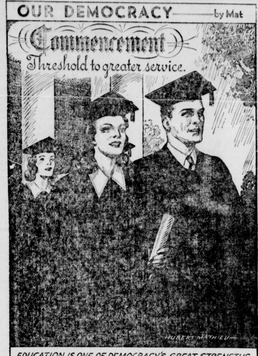
EDUCATION IS ONE OF DEMOCRACY'S GREAT STRENGTHS. WE AMERICANS HAVE PROVIDED THE MOST COMPREHENSIVE SCHOOL SYSTEM IN THE WORLD - HALF OF OUR BOYS AND GIRLS FINISH HIGH SCHOOL -ONE OUT OF 16 IS GRADUATED FROM COLLEGE - GIVEN THIS OPPORTUNITY BY THE SAVINGS OF MOTHERS AND FATHERS. EDUCATIONAL INSURANCE POLICIES, SCHOLARSHIPS-

OMEN WANTED! You can make oney supplying consumers with e well known Rawleigh Products. supply stock, equipment on edit; and teach you how. No ex rience needed to start. Over 200 sily sold home necessities. Large peat orders. Permanent, indepennt, dignified, Many women now aking splendid incomes. Full or Pare time. Write Rawleigh's, Dept. XE-710-144, Memphis, Tenn.