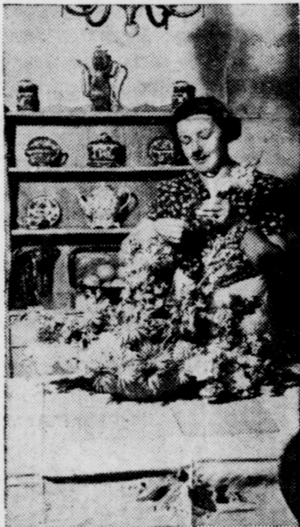
Designing, creating and making up attractive center pieces for dinner and luncheon tables is the favorite hobby of Fay Holden, Mickey Rooney's mother in the Judge Hardy series. Here she is shown making one of her special of African daisies, larkspur, snap-dragons and white stalk.