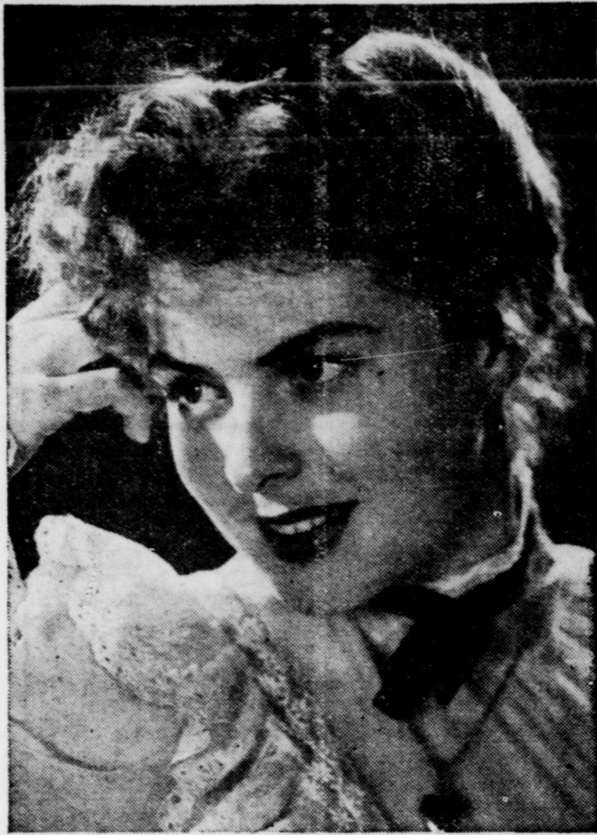
Ingrid Bergman, lovely young Swedish actress, has a totally different type of role in M-G-M's "Dr. Jekyll and Mr. Hyde," in which Spencer Tracy and Lana Turner are the other principal performers. B

"No fun straying any more! It's too easy for the Boss to round me up by telephone"