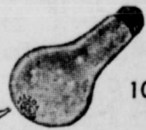
A 100-watt bulb

I'll help protect precious eyes 10 full hours for 5 cents. Could a nickel package of gum do as much? And which benefits the entire family most?