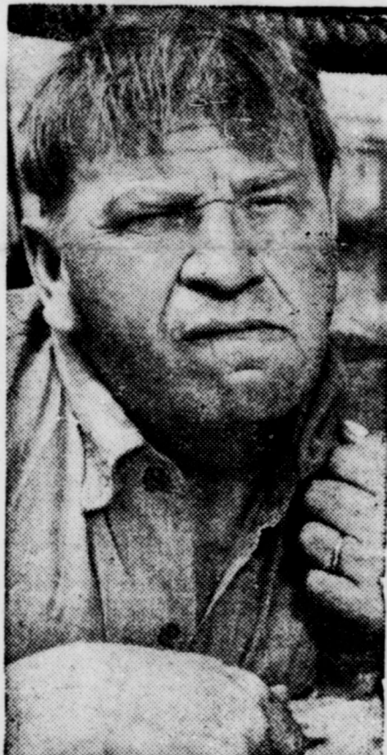
Wallace Beery as a roustabout fisherman has one of the most colorful roles of his career in "Barnacle Bill."