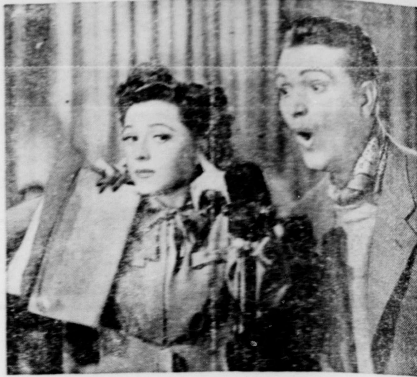
One of the hilarious episodes in "Whistling in the Dark" takes place in a broadcasting studio, with Ann Rutherford and Red Skelton as the parties involved.