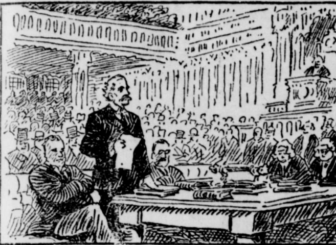
Today he is the head of the British government and upon him is centered the hopes of the notion for delivery from its crushing problems.