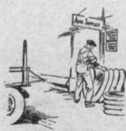
"Fresh, live U. S. Tires come direct to the dealer from his neighboring Factory Branch"

Here is the U. S. Usco Tread, with a long-established standard of service among motorists who have an eye to value, as well as to price. While selling for less than the other tires in the U. S. Pacific line, the Usco has earned a reputation for quality and dependable economy which is not exceeded by any tire in its class.