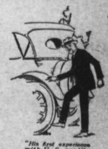
"His first experience with U. S. quality standard tires"

Giving your dealer a continuous moving stock of new, fresh tires built on the certainty of quality first every time