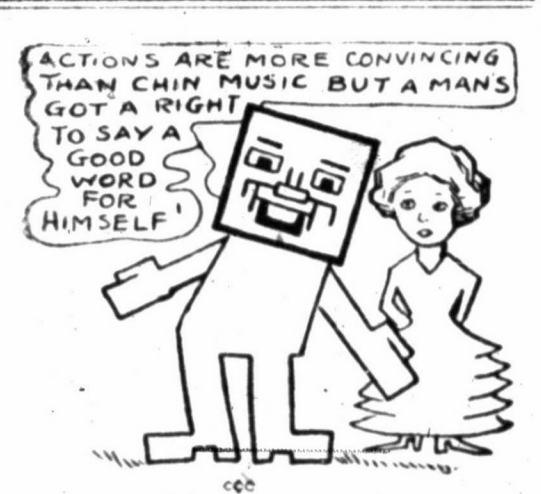
FAIR AND SQUARE

Underpriced, unsatisfactory food products put a pain producing dent in your digestion and your dollars. The really economical way of replenishing your pantry is to buy groceries of a proven value. The pleasing manner in which we will serve you will make you feel friendly toward us.