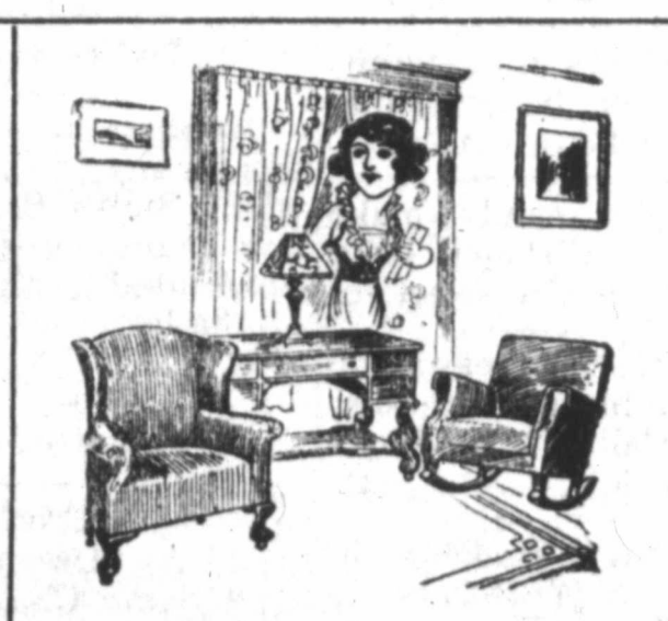
A Gift for the Family.

To your house you'll know it is right in fabric, weave, color and design if it comes from here. Why not come and, from our beautiful collection, select the rug you want him to bring? We'll lay it aside for you, if you say so. Come early for the widest choice.