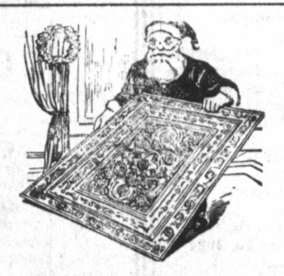
If Santa Claus Brings a Rug

Make a point of seeing this furniture. It is more than worth your while.