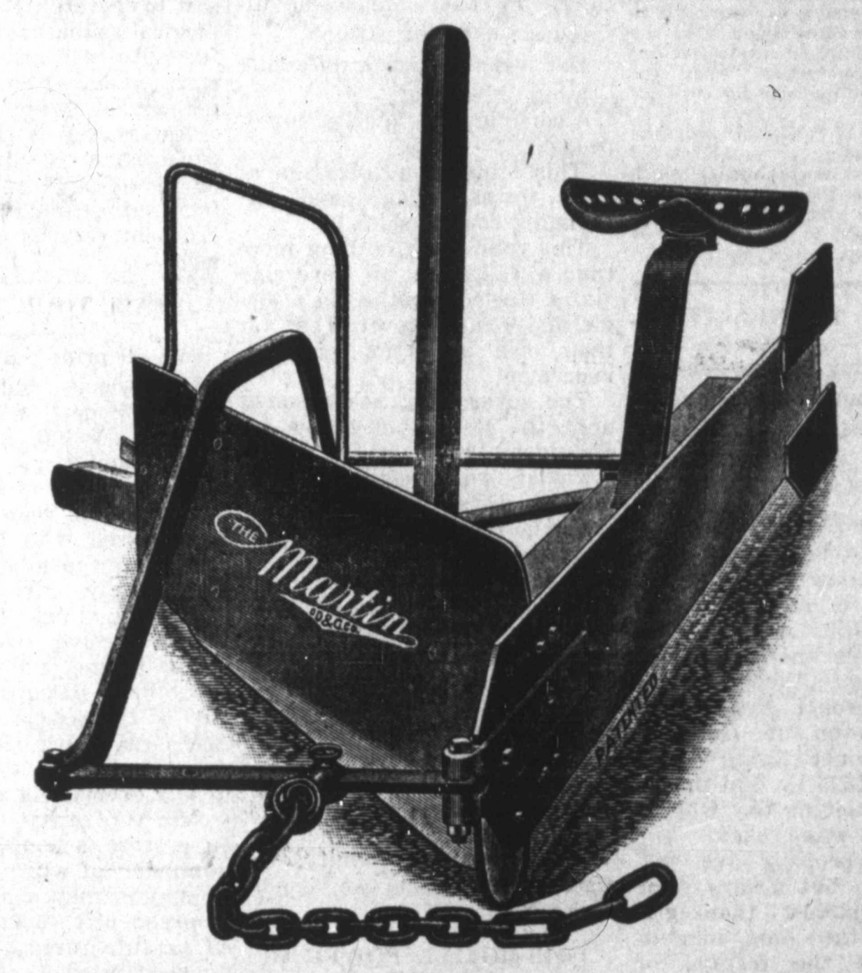
No More Back-Breaking Toil-Save Time, Labor, Expense

The old method of running ditches by hand has become too laborious and expensive all over the world. Even though you got labor free it would still cost too much to do by the old pick and shovel method. Bear in mind that the MARTIN will do your dirt moving job at less cost than the feeding of men to do it the old way.