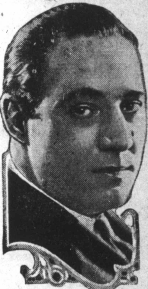
Elliott Dexter in the Paramount Picture Don't Tell Everything

money is in the state treasury rious banks in the state.