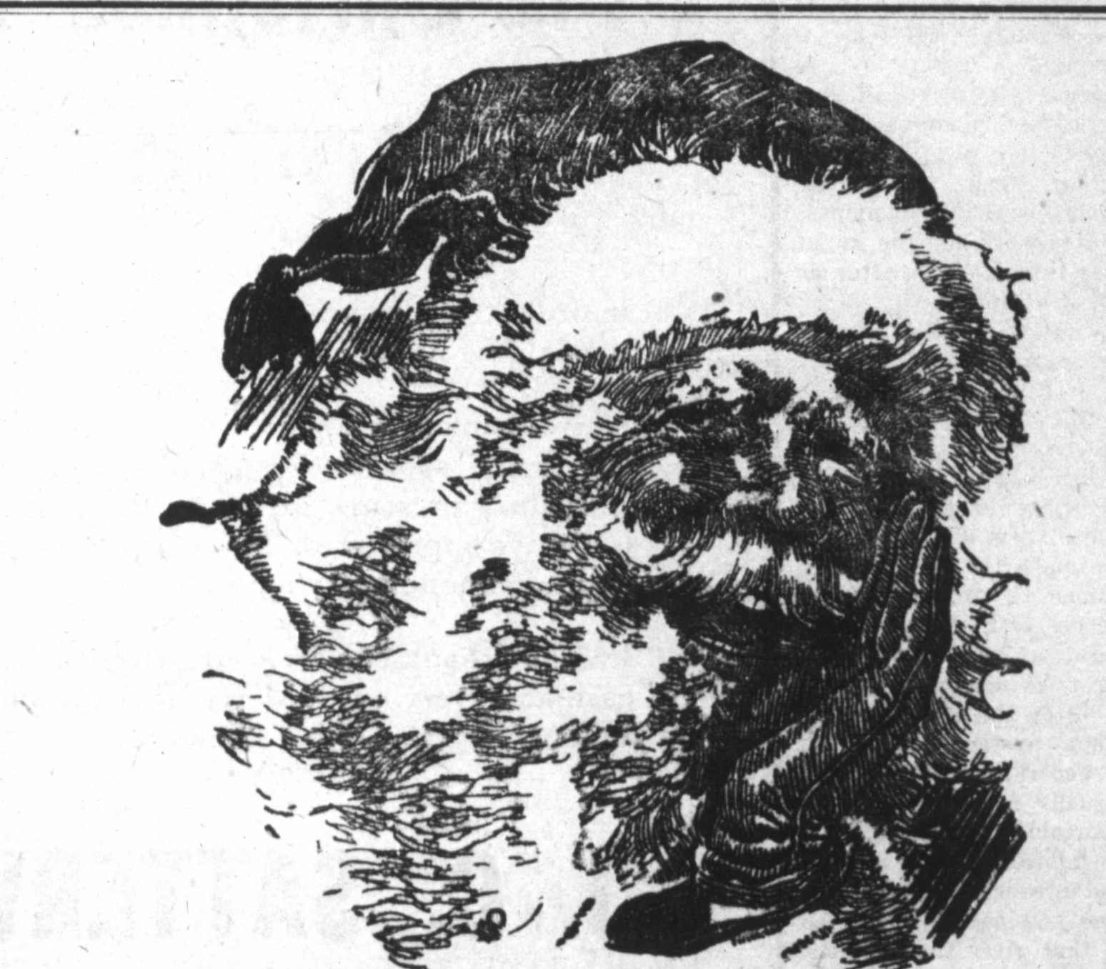
MERRY CHRISTMAS, EVERYONE.