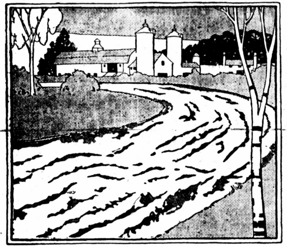
As It Is