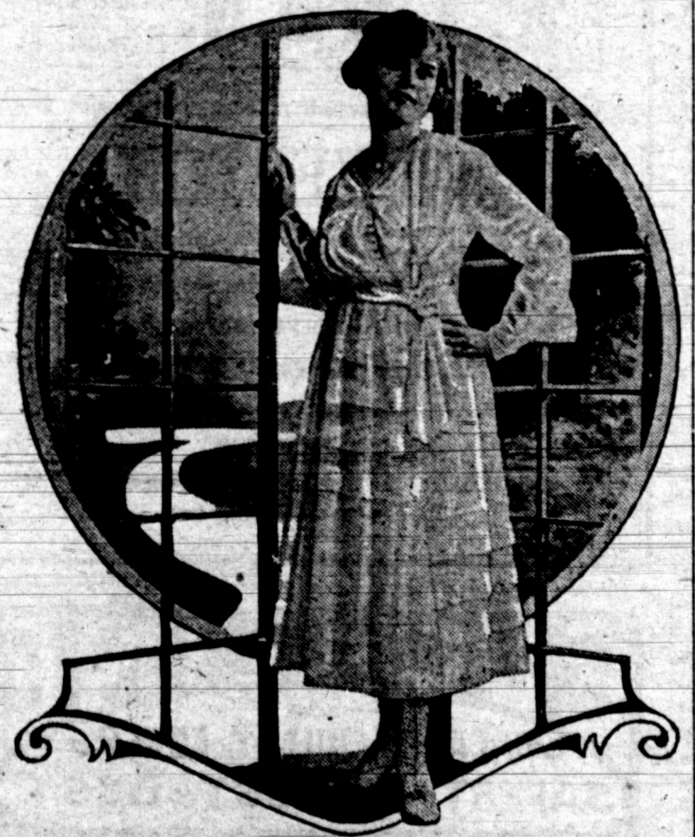
ALLURING FROCKS FOR MIDSUM MER.

The skirt is made with a panel baying four wide tucks at the front placed on its upper half. On the remainder of the skirt the tucks are on the lower half. In the bodice a vest of satin fastens along a diagonal opening at the front with little satin-covered buttons. The rest of the blouse is of georgette, with shirred shoulder seams and the fullness at the front is gathered into small bead tassels. The and it is a simple arrangement of the long sleeves are finished with a row hair which is waved all round the of satin-covered buttons along the outbend and parted at one side. It is side seam. A girdle of wide, soft satin parted at one side, either left or right ribbon is wrapped twice about the