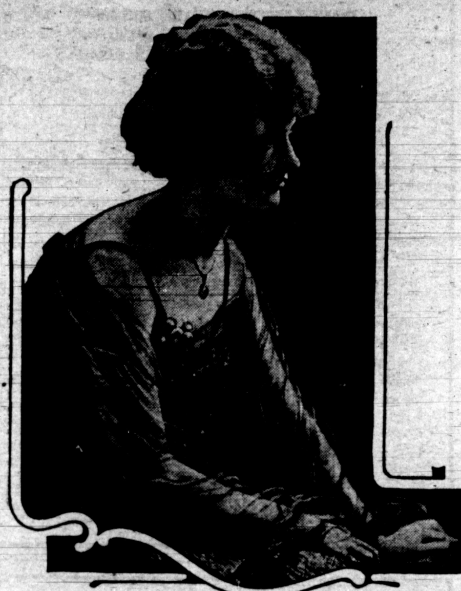
MAGIC LIES IN COIFFURES.

If you know of a sweet girl graduate that hasn't settled upon the style of her frock for the great day, or a bride who is casting about for something beyond criticism for her bridesmaids call her attention to this pretty model