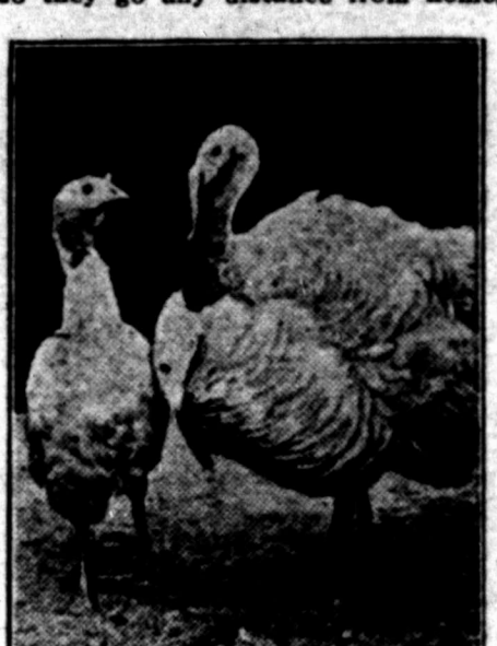
Pair of White Holland Turkeys.

When the poults are very young it is not necessary to keep the turkeyhen penned up more than a week, for she will go only a few yards from the coop, as she seems to realize the helplessness of her flock. Later, as the turkeys grow larger and stronger, the mother hens pick their way slowly through an adjoining meadow or field for a few hours each day, always coming home early in the afternoon. At no time during the summer or fall do they go any distance from home,