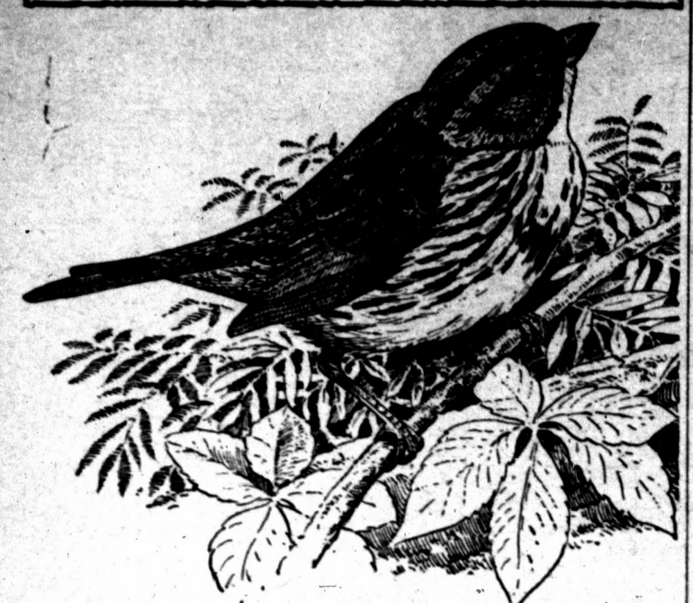
Song Sparrow-Above, Streaked With Black and Brown; Crown Chestnut, With Black Stripes-Below, White Streaked With Black and Brown.