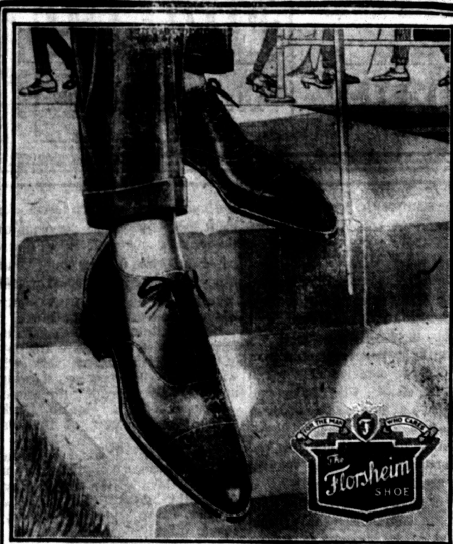
The Piccadilly—stitched toe cap—invisible eyelete—low heels—cool and comfortable because $5 Sheleton Lined and "Natural Shape"—$5