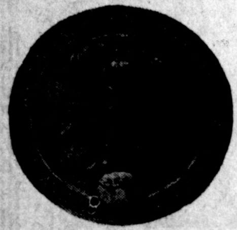
THE OFFICIAL EMBLEM OF THE PANAMA PACIFIC INTERNATIONAL EXPOSITION. SAN FRANCISCO, 1915.

Thousands of visitors from all parts of the earth will attend the Exposition. Each one of the eight transcontineutal railroads terminating upon the