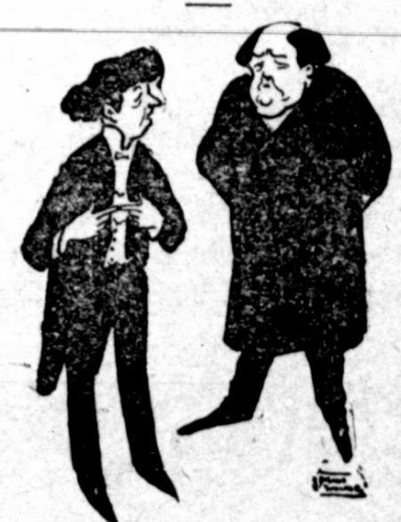
Table d'Hote-He holds the Italian ecord.

A la Carte-What Italian record? Table d'Hote-He ate a mile of spaghetti in three minutes and a