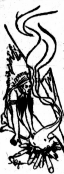
INVOKING LUCK IN THE HUNT.

It is generally supposed that Thanksgiving originated among the pilgrims of New England, but as a matter of fact the Indians had celebrated their thanksgiving feasts and dances centuries before the white man came to impart to the red brother his rifles, firewater and a new religion and civilization. America seems to have been dedicated to the thanksgiving habit from a much earlier day than was supposed. Some of the Indian tribes celebrated the festival not only once a year, but twice and even oftener. When the crops were growing they were thankful. When the young corn was milky in the ear they were thankful again. Part of the tribes had a day for gratitude, also for invoking luck in the hunt when the rabbit season appeared. Others, such as the Poncas, held a dance and a feast at about the same time as our Thanksgiving, their idea apparently being to offer up to the Great Spirit acknowledgments for the completed harvest.