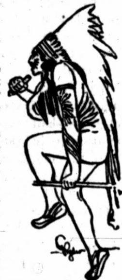
THE THANKSGIVING DANCE.

One peculiar feature of all the Indian's religious ceremonies—the dance—has never been understood by most white people. Originally it was a form of prayer, as inseparable from praise or petition as singing or making medicine. These dances were not the leisurely or elegant pastime of the paleface, but exercises into which the red men entered with all their souls and bodies, especially with their bodies. Into such a frenzy would they work themselves that they would fall out of the dance literally exhausted.