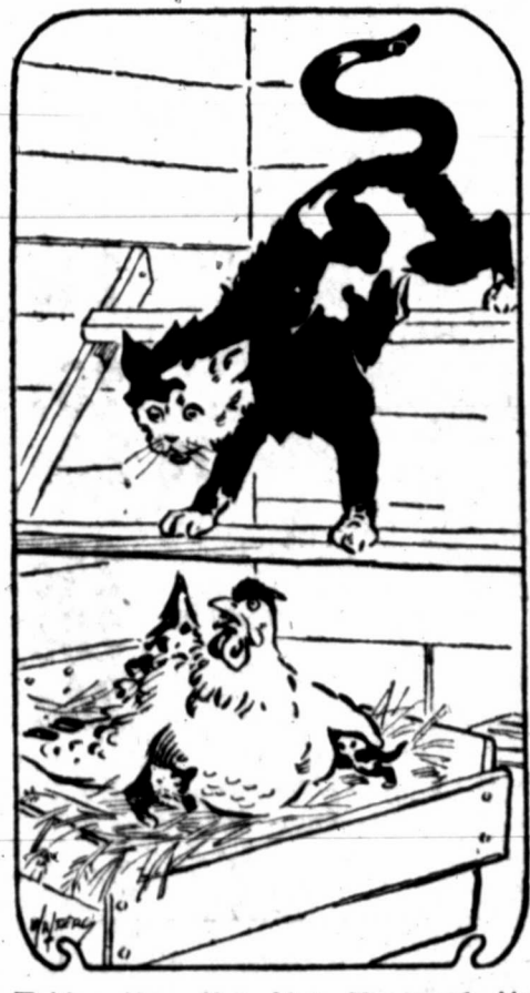
Has Not Yet Mustered Up Courage to Fight.

It was a fateful coincidence that the nest happened to be the same one in