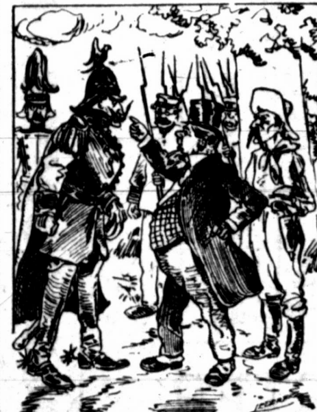
Pa Glowered at the Kaiser as Though He Would Eat Him.

The kaiser said, "Vot iss," and as the ship came nearer, and he saw the cowboy with a blue shirt and white