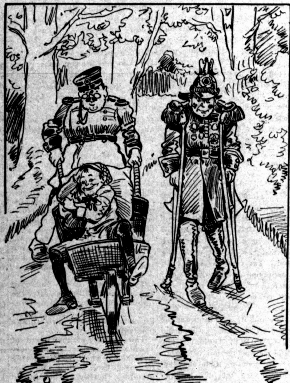
He Walked on Crutches and They Had to Wheel Me.

Affectation is that spirit which prompts you to say to your guest: "Do you care for cream in your coffee?" when you know right well that it's milk you are passing, and mighty this milk at that.—Detroit Free Press.