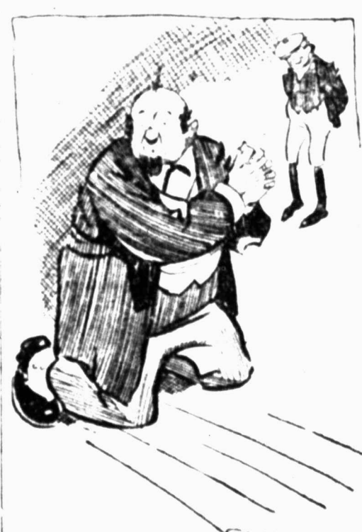
ON HIS KNEES.

maybe at he with a piece of meat. The beef exter got red in the face mor, and I noticed that dad shied at a source log as a fish tast and that and said Begging your pardon, don't some of the preces of armor, so when maker pier with a growler of beer you know, out hil was not 'ere at the we got right into the midst of it, and Say the lunk of meat with a bone time. This listory was made six 'un- there was armor on every side, and dad