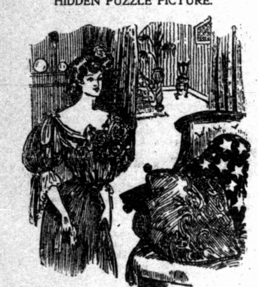
Find Her Caller.