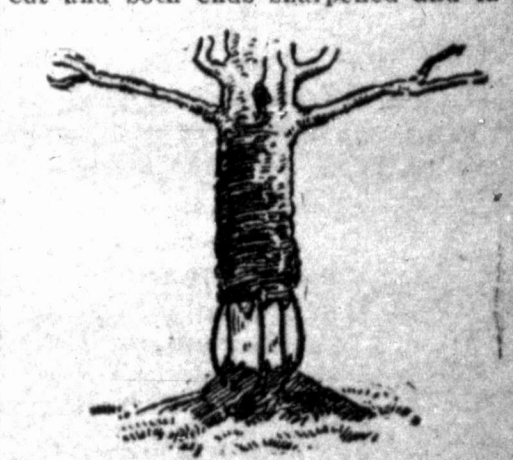
Girdled Section Bridged With Scions.

serted under the bark, so as to connect the bark at the roots and that above the girdled part (as per cut.) A tree six inches in diameter should have at least six grafts inserted, and if all "take" in five years the wounds should be entirely grown over. The cions can be fastened at both ends with thin wire nails. Bark to bark as in grafting and the use of good grafting wax made of beeswax, tallow and rosin are required. Where the bark has been removed by the mice the trunk should be protected from the sun and dying winds by moss kept moist, cow manure wixed with clay, or the tree banked up with earth. By this method the writer has saved many a tree.-Exchange.