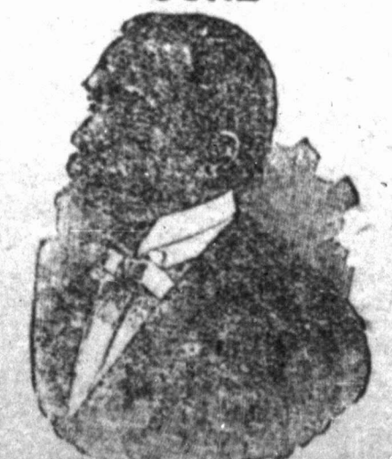
(This Picture on Every Bottle)