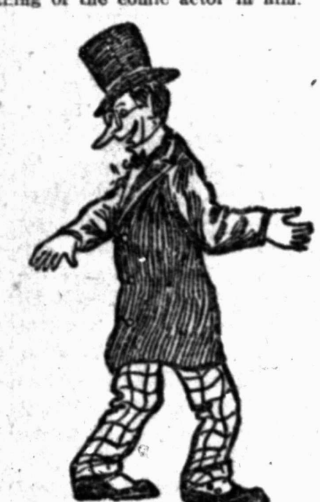
Which Way Is He Going?

The effect of this grotesque make-up is indescribably funny, part, ularly if the boy who assumes it was something of the comic actor in him. It