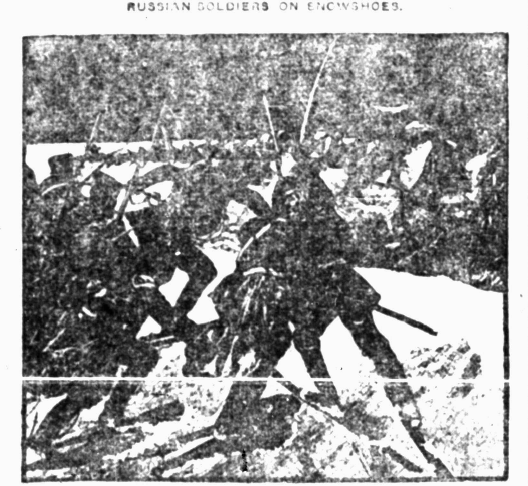
Part of the Russian regiments now in Marchuria are equipped with anowshops, which will be of great service in the snew covered hills of Manchuria and Corea

kined about the Variag and also a. The Rillians per an advince of fow of the casualties aboard the Ack the Chitest rimy and the cutting of M. St. Nev l. and the Pa'ala was the transfer, on raffway by them. clude the losses of the day before of clear tro ps are in Shan Hal Kwan, the rathern fronter. These troops are being reinf reed daily. They are Ten Tsin Like a Staughter House. We'l drived and armed with modern Pokin, March ? - The native city of weapons, and are the present flower of the Chinese army. It is the gener-