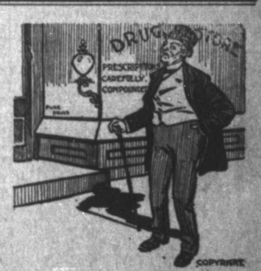
A TOUCH OF "RHEUMATIZ?"

There is a right kind and wrong kind of soap to buy. Try