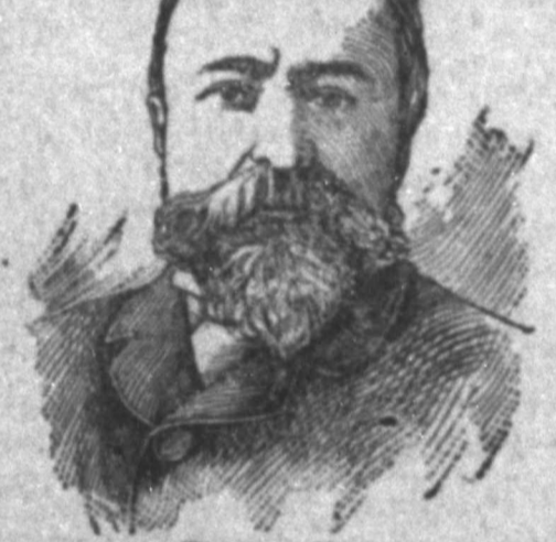
Thomas Nast, money bag, the Republican party elephant and the Democratic jackass originated with him. The line of work since developed and improved by some was entirely of his creation.

Thomas Nast may be said to have been the original newspaper cartoonist, and it was to his talent that cartoons in the daily press owe their earliest development. Among the well-known caricatures and types used in political cartoons Mr. Nast created many. The Tweed