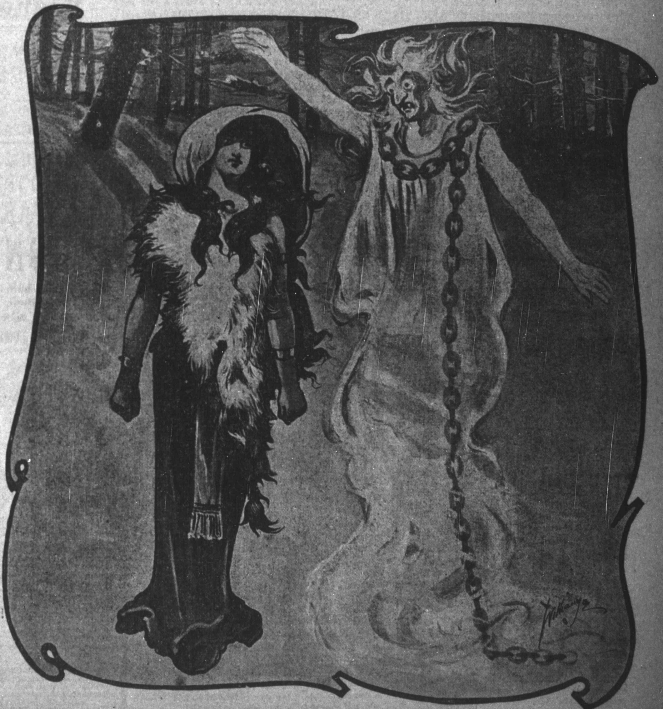
"Johan, thy betrothed!" shrieked the hag. "Girl, thou art mad. Get thee gone, and at midnight on the Jul Aften I will bring thee a jewel such as none can boast, but not Johan. He is mine, I tell thee, mine forever. I will not give him up," and she raised her arm as if to strike, but now Olga feared her not.

Johan was quickly restored by copious libations of hot punch, and when able to stand on his feet, Karl put his hand in that of Olga and gave the pastor a signal. Forthwith, Olga took Johan for her husband, and when the final words were spoken, a tem-