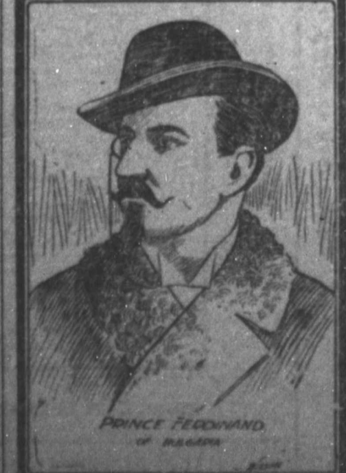
PRINCE FERDINAND OF BULGARIA

Police Arrest Anarchist at Ferdinand of Bulgaria's Residence. A supposed attempt to assassinate Prince Ferdinand of Bulgaria was