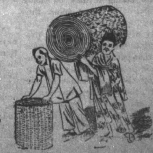
Mattings from Japan.

Everyone knows that if fur- If you have any pictures you niture is not properly packed, it prize, and want to keep, bring gets battered and bruised. them here and get them framed. When you buy from us you We have a splendid assortment of run no risk of having it ruined, the most up-to-date Moulding and suit the most economical.