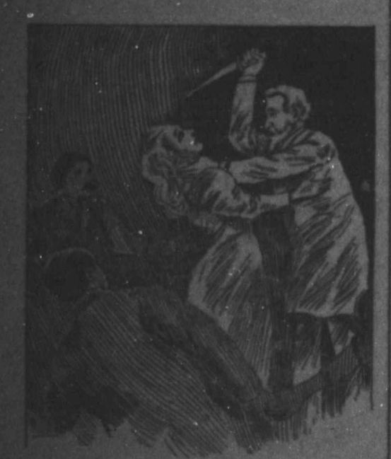
HE THRUST THE DAGGER.

teh to wait the coming of Harry. At precisely 7:30 my friend walked to my room and told me that a cab a waiting in front of the house. In re minutes we were rolling along the treets of Philadelphia. The De Mort