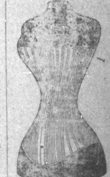
Those who have worn the F. P. Corset say they will have no other.

Our ready made clothing is rapidly styles and new colors; come going for less money than other merchants pay for it. Don't buy old motheaten, dusty, dirty suits at cost when we can sell a brand new suit just from the factory for less money. We never fail to sell any one when they see our goods and hear the prices, remember these 42 well worth from $3.50 to $20.00 now going from $1.50 to $11.00 per suit.