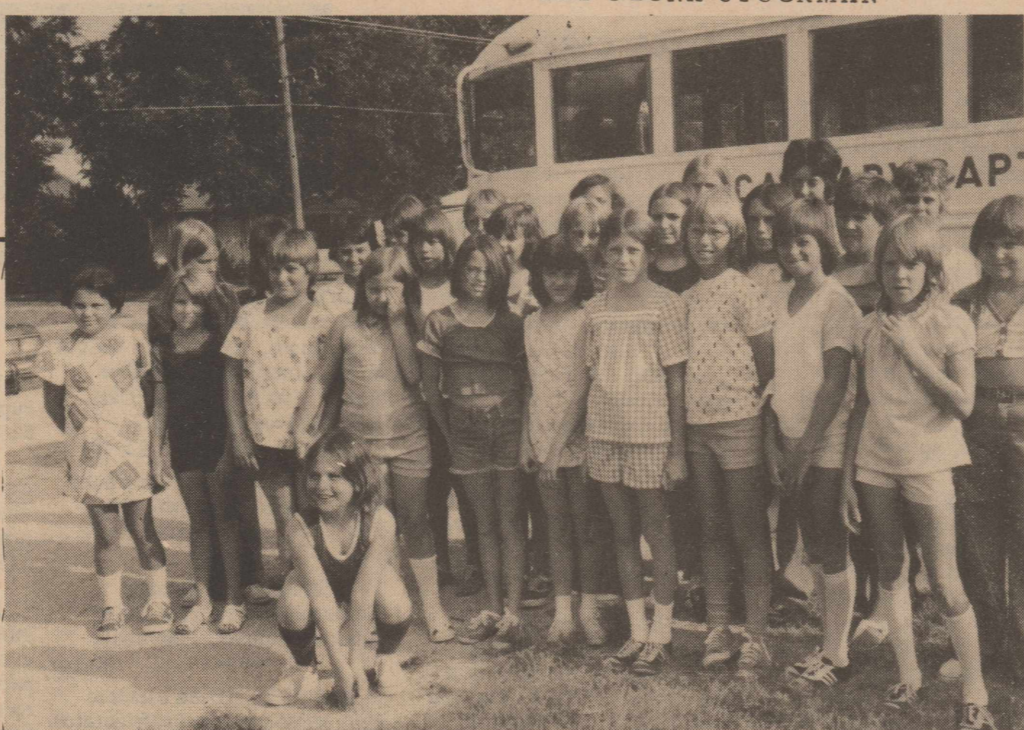
TWENTY-NINE OZONA GIRLS along with their counsellors and youth director get ready to leave for camp at Paisano early Monday morning for a week of activities. Bus is loaded and ready to go.