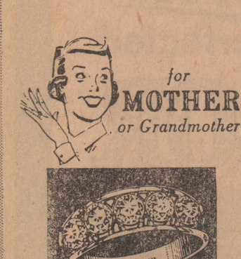
to show detail 14K GOLD A RING with the BIRTHSTONES of children . . . husband and wife

Gift Suggestions Cut Crystal Table Lighters Charm & Bracelets Cuckoo Clocks Pierced Earrings Wedding Bands Stainless Steel Billfolds Cuff Links Cross Pen & Pencils Silver Casserole Cooper Gifts Steak Knives Jewel Boxes And Many More