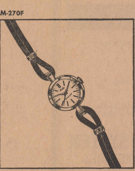
GAIL-17 jewels; 14K yellow or white gold; suede cord. Self-winding $115.