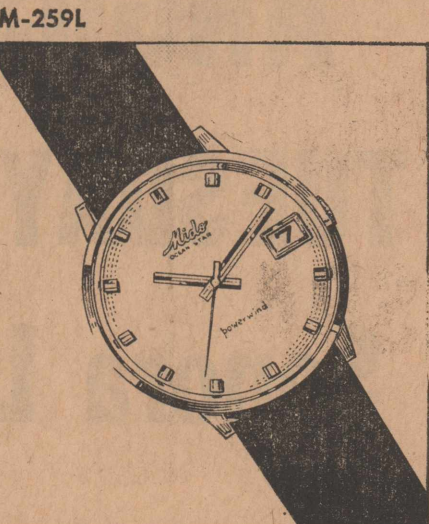
DCEAN STAR "36"-Stainless steel with silvery dial $120. Yellow Midoluxe with gilt dial $135. Fed. Tax incl.