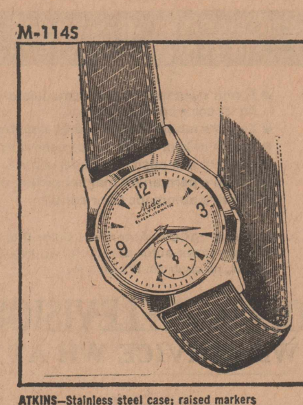
ATKINS—Stainless steel case; raised markers and numerals; 17 jewels; waterproof $69.50.