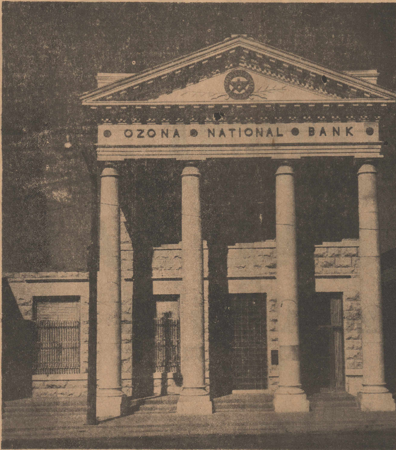
FINANCIAL COLOSSUS of Crockett is housed in modern quarters behind the impressive pillars which form the outstanding features of the 50-year-old building housing the Ozona National Bank. The bank this week is observing its fiftieth anniversary in Ozona, a financial giant of today in sharp contrast with its modest beginning a half century ago in the rear of a downtown drug store. Although its walls are of ancient rock, the bank has been given successive face-liftings until today, with its glass front and polished pillars, its modern exterior, and interior, belie its years.