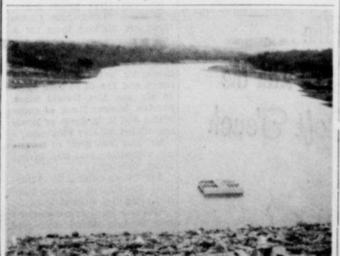
SITE 6 — Flood water being released orderly into Pecan Bayou through 30-inch pipe on rock-blanketed plunge basin.

In addition to the 11 completed structures on the Upper Pecan Bayou, there are two more sites cleared by the sponsors ready for construction. These are known as Site 9, located on Bonnie Farber, Miss E. M. Seale and Betty Wilson ranches, and Site 21, located on Walton Baum, J. D. Baum and Hudson Smart ranch. Site 9 is located approximately 5 miles Southwest of Baird, and Site 21 is located approximately 3 miles West of Cross Plains, Herring said.