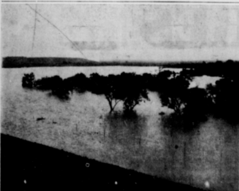
SITE 10 — Flood water being detained above flood water retarding structure, located on Virginia Mullins ranch, 15 miles South of Baird. Flood water 8 feet above principal spillway.

A special thank you to all the people who helped in any way in making this year's show a success.