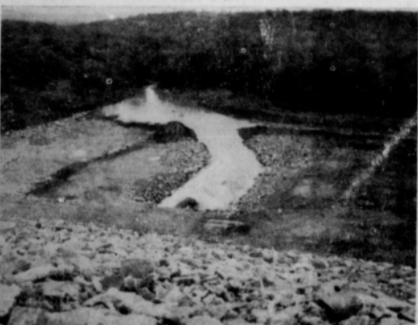
SITE 6 — Flood water being detained above flood-water retarding structure, located on Bill Cutbirth ranch, 15 miles Southwest of Baird. Water being drawn down through principal spillway to permanent water level.