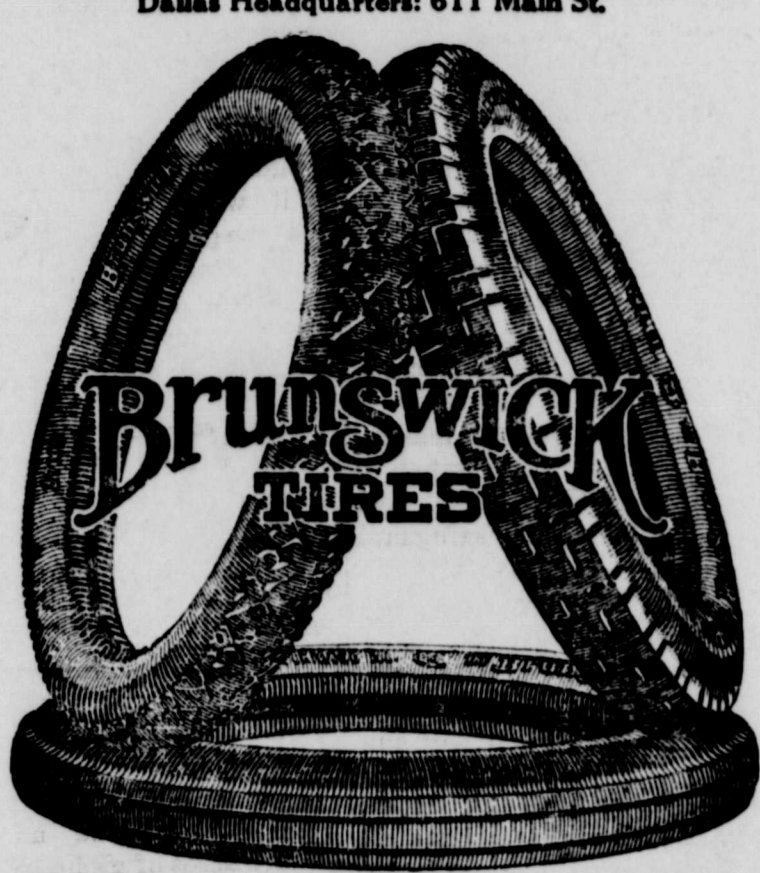
There's a Brunswick Tire for Every Car Cord-Fabric-Solid Truck

THE BRUNSWICK-BALKE-COLLENDER CO. Dallas Headquarters: 611 Main St.