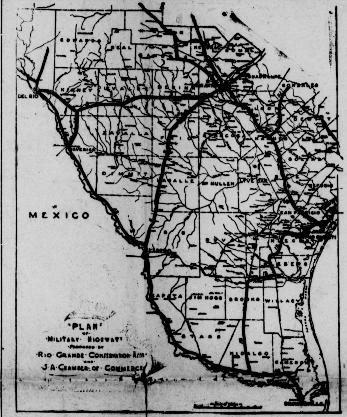
Sketch showing plan for system of Military Highways recenty adopted by San Antonio Chamber of Commerce and the Rio Grande Conservation Association.