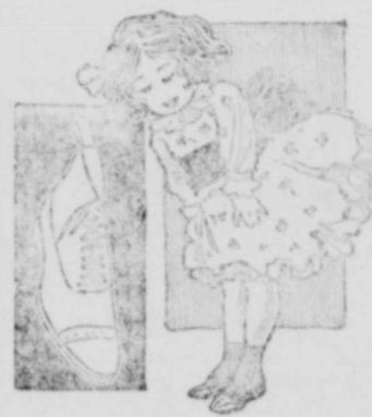
No better Shoes on the market today than the brand we sell. For Men, Women and Children.

ash shirtwaist goods; all of the best by embroidery. A new line of cor- in white embroidered wash belts s for women and children. Also a est and most practical styles. ountry has ever known and there is becoming and economical for all.