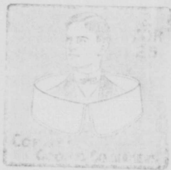
Why do you want to pay a higher price for Collars when you can get equally as good here for less money.

Line of Summer Merchandise is just what you want.