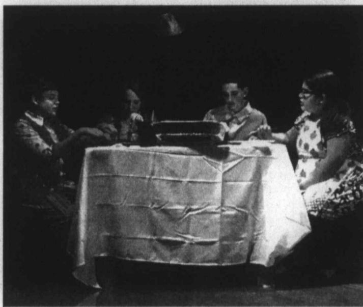
Play performance ... Come out to Tahoka High School Auditorium on Tuesday, Nov. 14th to see TISD Junior High students perform their One Act Play, Goodbye to the Clown . Performance starts at 7:00 and admission is free.