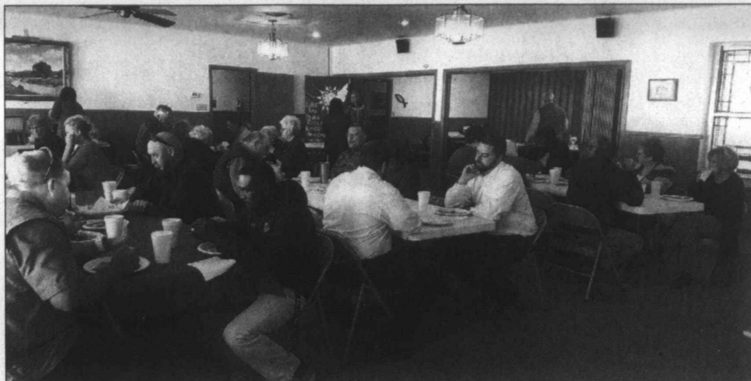
Election Day lunch ... Tahoka citizens enjoyed the annual Election Day lunch and bake sale hosted by First United Methodist Church every November. Proceeds from the Mexican Stack lunch were to go towards missions and the Lynn County Pioneers Senior Citizens Building Fund.