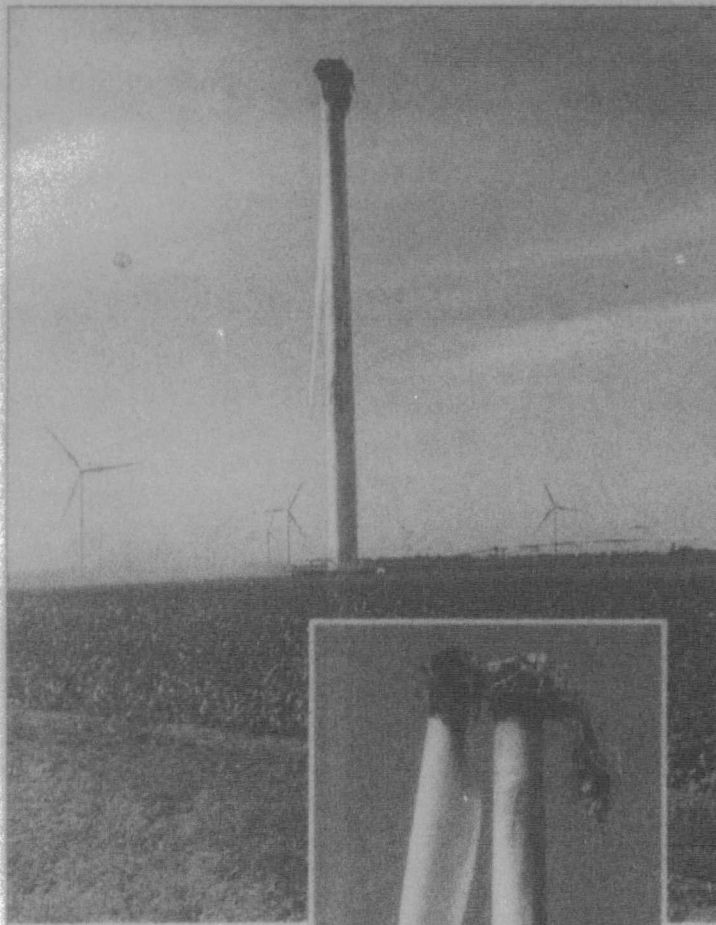
Wind turbine burns near Draw...

O'Donnell Volunteer Fire Dept. was paged out at 5:40 a.m. Monday, Oct. 31 for a wind turbine fire approximately 5 miles east of O'Donnell on Farm Road 213 (just west of Draw). According to Mark Royce's information on the OVFD's facebook page, three units and eight men arrived on scene, to a wind turbine fully involved. The location of the turbine was at County Road 88, just South of Farm Road 213. As units arrived two of the three blades were burning and broke loose, falling to the ground. The one remaining blade hung parallel to the tower, which made the area unsafe for entry. Units remained on scene for about hour monitoring the scene. A few small fires on the tower continued to burn, as did the two blades and cone on the ground. The fire was allowed to burn itself out due to the unsafe conditions. Cause of the fire was unknown. Units were back at the station at 7:08 a.m.