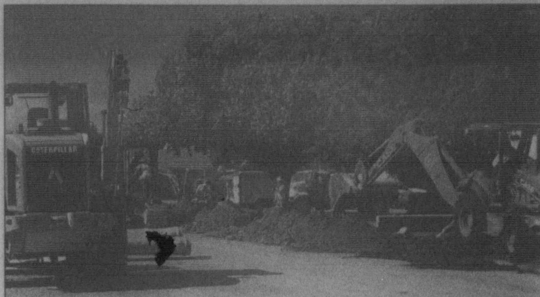
Waterline project... Progress continues on the City of Tahoka's waterline replacement project, which began in mid-October. In this photo taken last Thursday, workers were digging trenches and laying pipe along the front yards on North 6th Street, between Ave. L and K. City residents are reminded to use caution in work zones, and to speak with construction workers if there is an issue accessing their property.

The station will be visible on the left in the far open corner of the field.