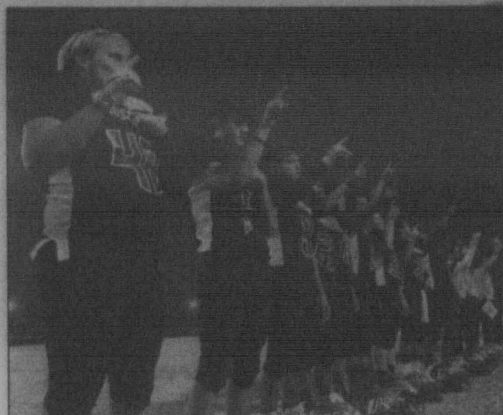
Mustang pride... Wilson players display the Mustang #1 during the playing of Wilson's school song.

I hope each player knows how much they mean to the fans, and that sometimes they just have to listen to Mike Singletary, who said it best, "Do you know what my favorite part of the game is? The opportunity to play."