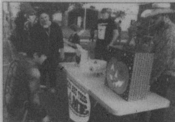
Fun at the carnival ... Oh what fun we had at the Wilson carnival on Halloween!