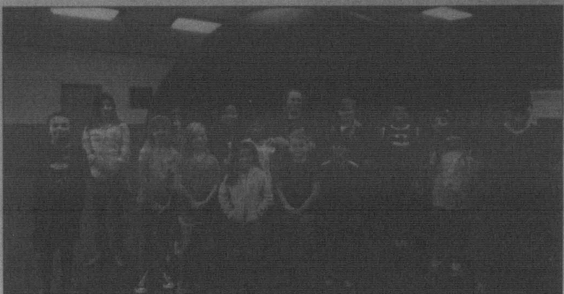
Outer space... Pictured here is one of two large groups of children who participated in the Science Spectrum Space Bubble that came to the City-County Library in Tahoka last week. The Space Bubble showed participants how to scan the nighttime skies for constellations and falling stars.

All queen candidates support the scholarship program by selling Harvest Festival Queen raffle tickets. This year's Queen raffle ticket features 5 chances to win $2000 in prizes, including a grand prize of a $1000 prepaid Visa card, and four drawings for $250 prepaid Visa cards. The drawings will be held at the Harvest Festival on Saturday, Sept. 17.