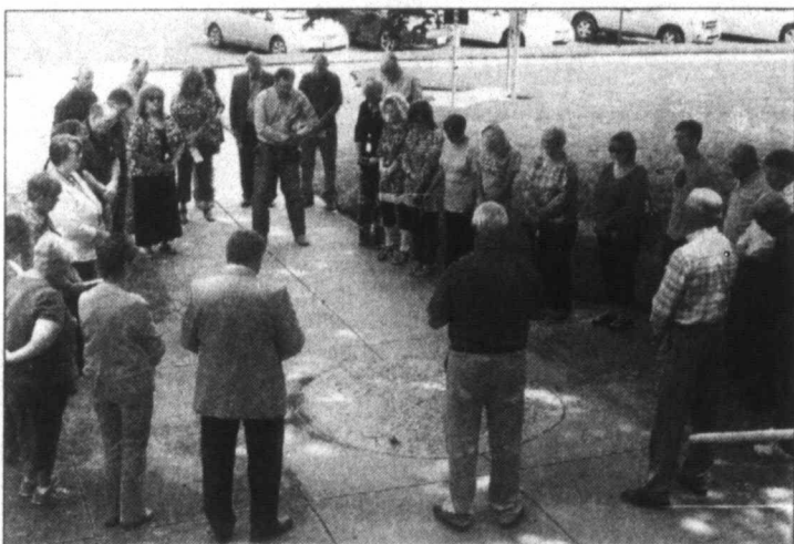
National Day of Prayer... Lynn County citizens gathered at noon last Thursday at the courthouse steps in Tahoka to participate in the National Day of Prayer. Those attending recited together a published prayer, which was prayed simultaneously across the country at noon in the different time zones, and also prayed for county and city officials, law enforcement and first responders, school students and staff, and others, led by volunteers.

The couple plans to marry Saturday, May 16, 2015 at Difference Makers Church in Lubbock.