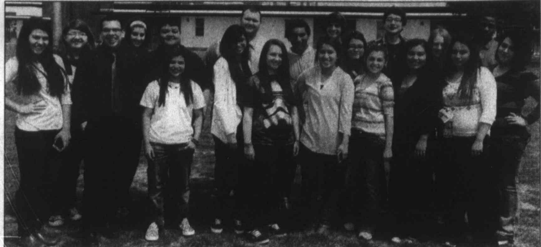
Job Shadows... As part of National Hospital Week these Tahoka High School AVID students job shadowed on Monday, May 11 at Lynn County Hospital. They worked in many departments at the hospital and gained great knowledge and experience.