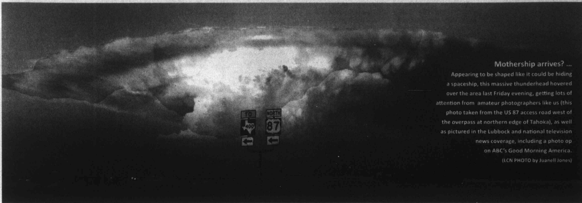
Mothership arrives?... Appearing to be shaped like it could be hiding a spaceship, this massive thunderhead hovered over the area last Friday evening, getting lots of attention from amateur photographers like us (this photo taken from the US 87 access road west of the overpass at northern edge of Tahoka), as well as pictured in the Lubbock and national television news coverage, including a photo op on ABC's Good Morning America.

erative Associa- -0719 or by calling 15-1102.