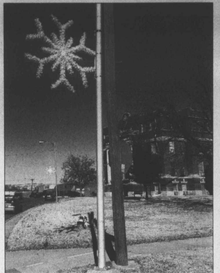
Big snowflake ... New Christmas decorations for the City of Tahoka were being placed around the city last week, as the holidays approach. The ACT Board and City shared the cost in purchasing 20 lighted snowflakes and 40 new Christmas banners, which have been placed on Lockwood Street and Main Street and around the downtown square. (LCN PHOTO)

"Like" us on Facebook! www.facebook.com/LynnCountyNews