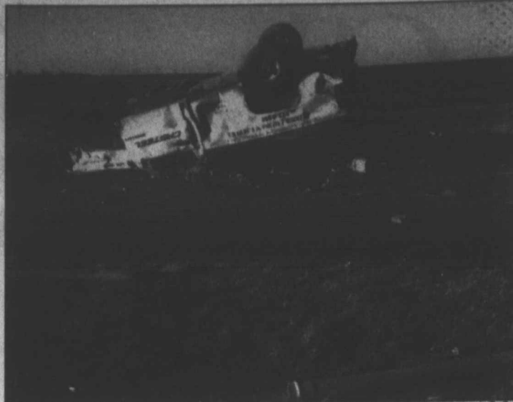
One of several wrecks ... The above pickup, owned by a Lubbock company, overturned about 6 miles north of Tahoka last Friday morning, and was one of several highway accidents in the county during the last week. The two men in the pickup both refused treatment at the scene.

The Tahoka Rotary Club meets every Thursday at 12:05 P.M. in the Life Enrichment Center. If you're interested in joining you can contact any club member or come to one of their meetings.