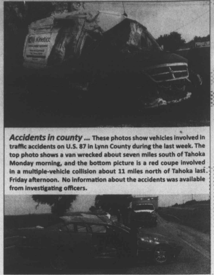
Accidents in county ... These photos show vehicles involved in traffic accidents on U.S. 87 in Lynn County during the last week. The top photo shows a van wrecked about seven miles south of Tahoka Monday morning, and the bottom picture is a red coupe involved in a multiple-vehicle collision about 11 miles north of Tahoka last Friday afternoon. No information about the accidents was available from investigating officers.

Send us your "Where In The World is the Lynn County News" photos, and we will publish them as soon as space allows. Email photos to: LynnCoNews@poka.com