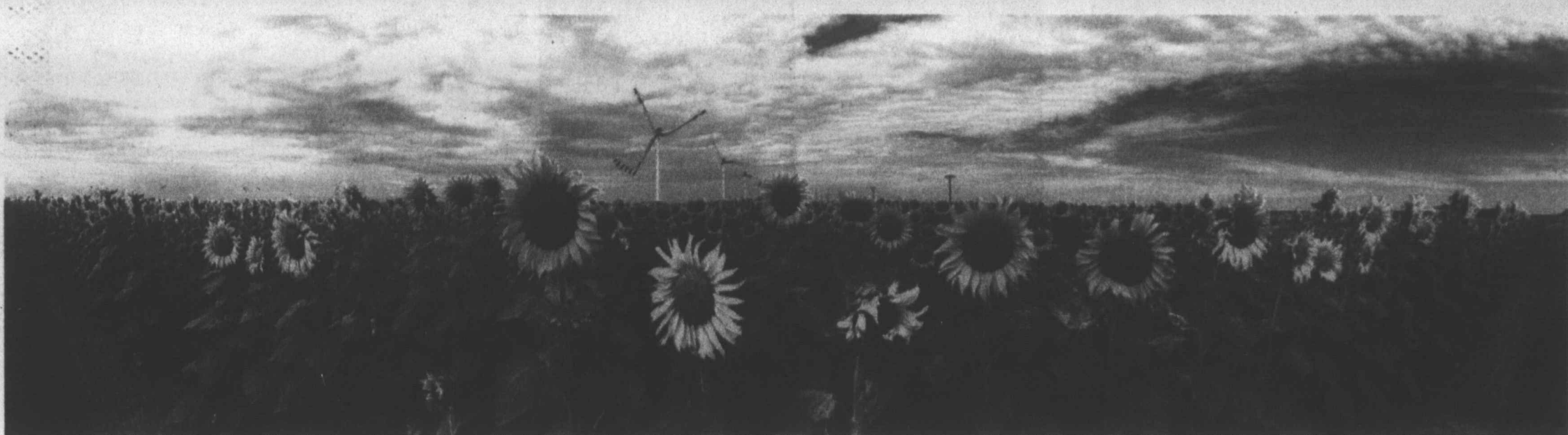
Field of blooms ... A field of sunflowers blooms beneath the wind turbines near FM 1054 in south Lynn County. This photo, taken in panoramic mode, captured the turn of the lower wind blade in several locations, creating an unusual effect where the tip of the blade appears to be suspended in midair.