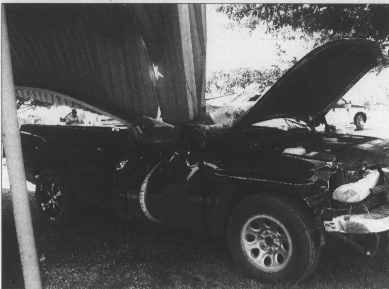
Strong pole crushes cab ... The metal roof and a pole supporting one corner of the carport punctured the cab of this pickup, then wrapped around part of the cab, crushing it, after a bizarre traffic accident at O'Donnell Monday afternoon. The driver of the pickup was injured.