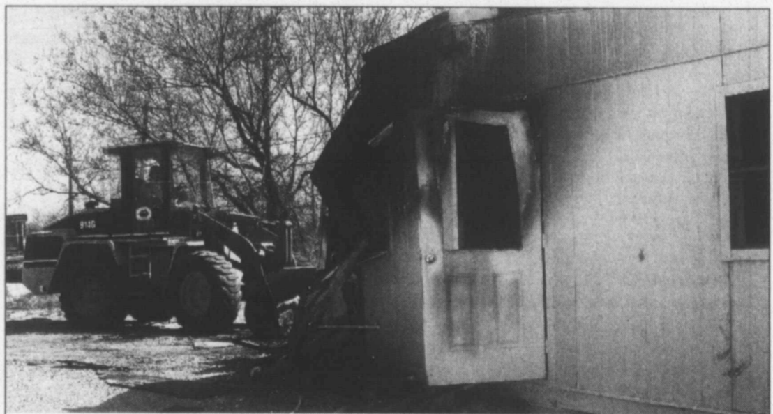
New beginnings... Workers are clearing off this building at the Lynn County Animal Shelter that was recently lost to a fire that claimed the lives of seven cats. To date, funds in the amount of $14,945 have been raised to help with construction of a new office/shelter. Also, Tahoka NHS and Student Council were able to raise $350 for the Lynn County Animal Shelter through the "Hugs for Pugs, Kisses for Kittens" fundraiser held recently.

But if they should catch them somehow, they should be tied to a chair in front of a speakerphone with an endless recording saying, "Your call is important to us. Please hold and the next available representative will be with you in one hour, or at least about 10 seconds before your cell phone battery runs down. Press 1 for English, 2 for Spanish, or 3 for 30 minutes of uninterrupted really bad music."